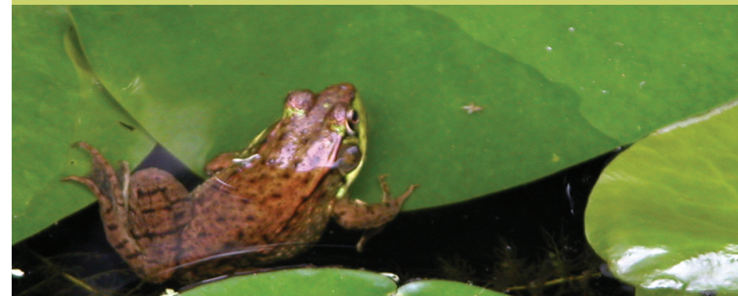
Connecticut's Statewide Forest Resource Plan

University of Connecticut Cooperative Extension System U.S. Department of Agriculture 139 Wolf Den Road Brooklyn, CT 06234