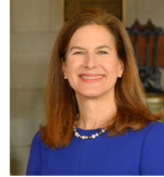
Connecticut Lt. Governor Susan Bystewicz