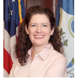
CT DEEP Commissioner Katie Dykes

USE THE FORM BELOW AND MAIL BACK WITH CHECK, OR PAY ONLINE